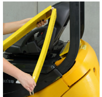
Easy to store away