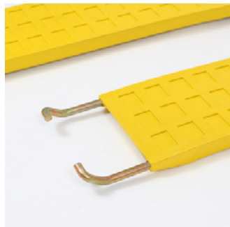
Secure heel hook