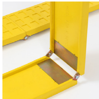
Strong hinged joint