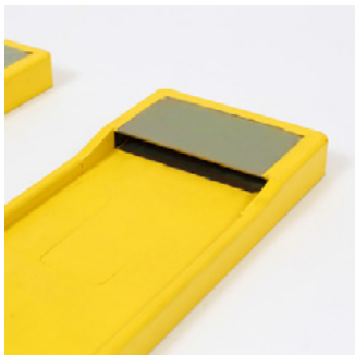
Slotted toe cap